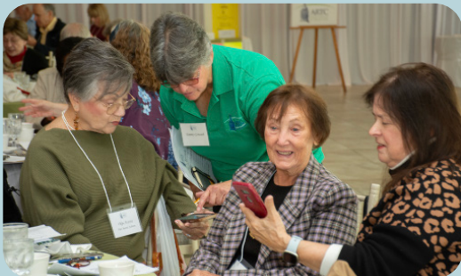
Attendees getting ready for the Trivia game