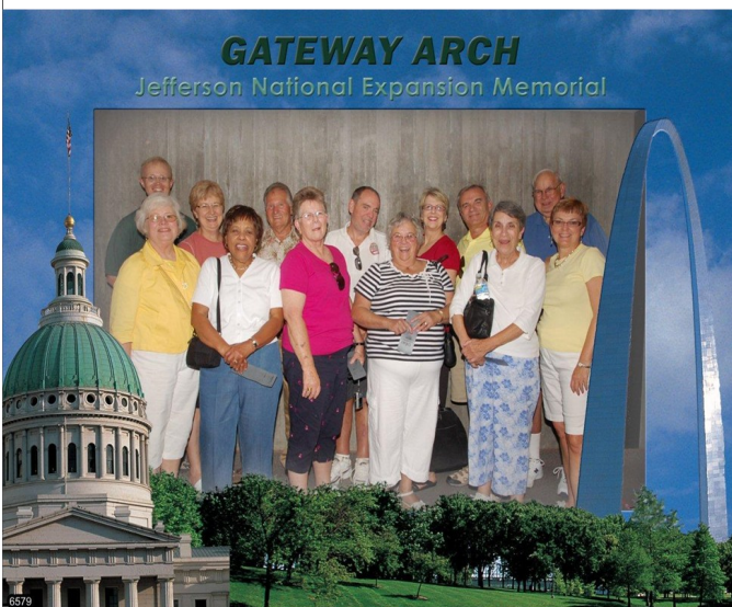
Some of the 2010 ASRTE Conference attendees at “The Gateway Arch” in St. Louis on Wednesday, August 4, 2010. That’s me in the back row, middle!

I attended the 2010 ASRTE Conference in St. Louis, MO on August 3 - 5. This was the third conference I’ve attended, and as usual, the sharing of issues/ideas was impressive!